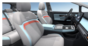
LIGHT BLUE COLOR