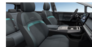
DARK GREY COLOR