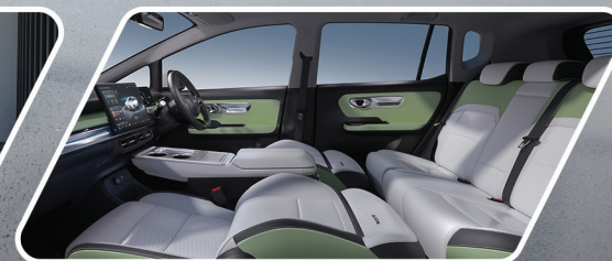
Trendy Spacious Interior