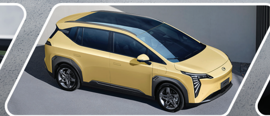
Trendy Exterior Design