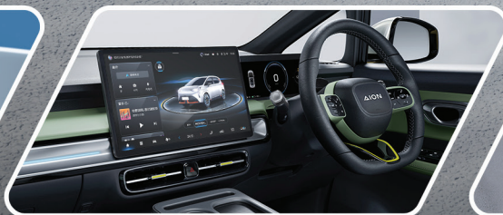
Trendy Smart Technology